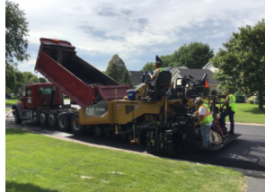
Installation of new asphalt surface