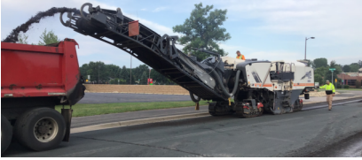
Removal of the existing street surface by milling

In the months/years following installation of the new asphalt surface cracks will appear. The formation of these cracks are a reflection of the cracks in the underlying asphalt layer. Cracking in the new asphalt surface is a normal occurrence and does not mean the street is damaged or defective in any way.